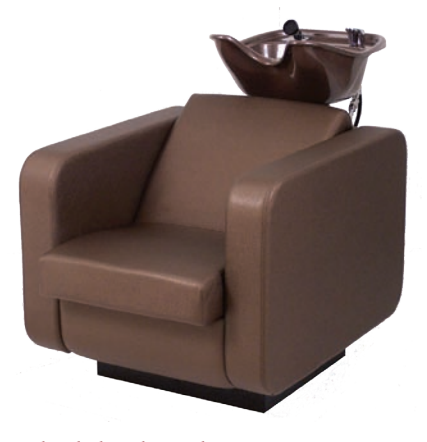
Plush backwash, PH04 (30"w \times 46"d \times 32"h)