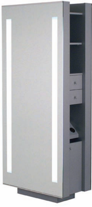
Available in half mirror with shelf. Available as single wall-mounted station.

▼ Crown, CW35 (20'w x 17"d x 84"h) CW192 mirror & frame (38"w x 7"d x 76"h)