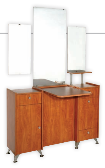
Profile Wet Station , PR28/PR44/PR27 (61"w x 16"d z 47"h) Predrilled for mounted bowl