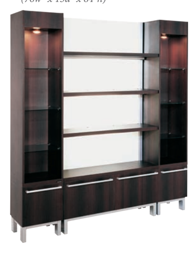
Kallista, KT182 (1ea.), KT183 (2ea.) (76w" x 15d" x 84"h)