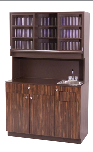
Color Wave, CWB62-HPL (48"w x 24"d x 78"h)