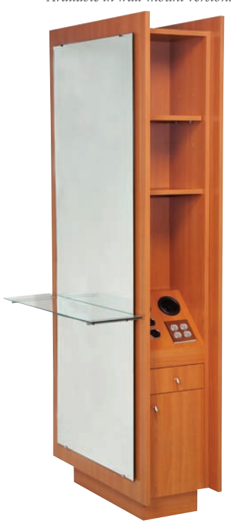
Available in wall-mount version.