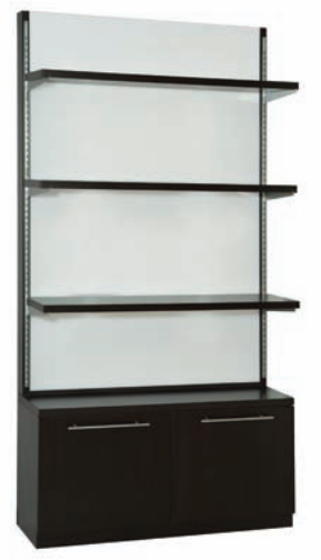
Kalli, KA182 (44"w x 17"d x 84"h)