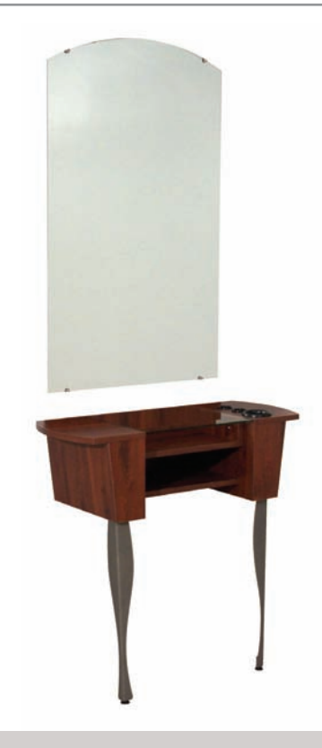
▲ Brandi, BR126 (36"w x 15"d x 38") /7105579M-1 mirror

Warranty: Cabinetry: 1 year warranty, Seating, 1 year warranty on fabric. Cast iron Bowls, 5 year warranty on enamel, lifetime warranty on structural ingretity. See your Belvedere representative for a full warranty.