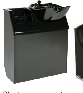
Siesta, S54M/8400k (32"w \times 23"d \times 35"h)