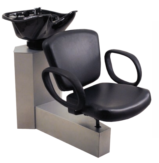
Pacific, PA54/PA54CHR (24"w x 44"d x 42"h)