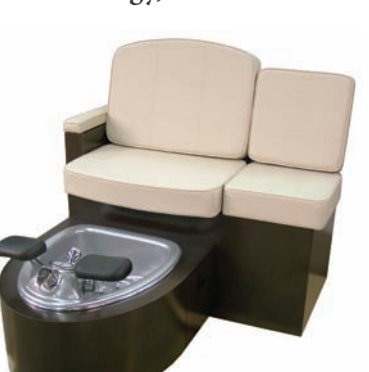
Capri Pedicure Pipe Free Clean Technology, CPR01