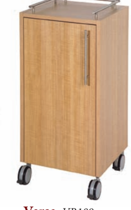
Versa, VR109 (16"w x 16"d x 34"h)