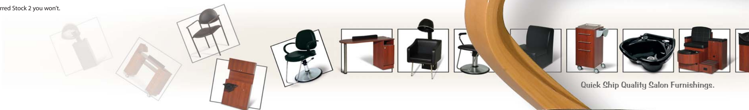
Quick Ship Quality Salon Furnishings.

Speed. Support. Service. That's what you'll get from the second generation of Belvedere Preferred Stock. We've identified our most popular salon and spa products and made them available to you in a quick shipment program. Belvedere understands your business and we know you don't have time to wait for quality furniture and equipment. And thanks to Belvedere Preferred Stock 2 you won't.