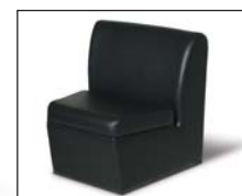
Newport Sofa Wedge PSNRS52-BL