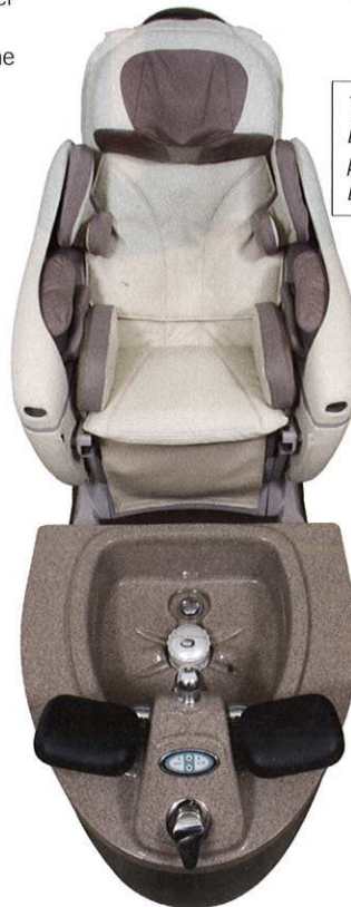
The Sogno DreamWave Spa pedi chair from European Touch

This new luxury pedicure chair gently cradles your clients for an experience of total relaxation. Built-in Inada infrared body scanning technology even identifies critical Shiatsu points and customizes the massage to the individual. Info: europeantouch.com