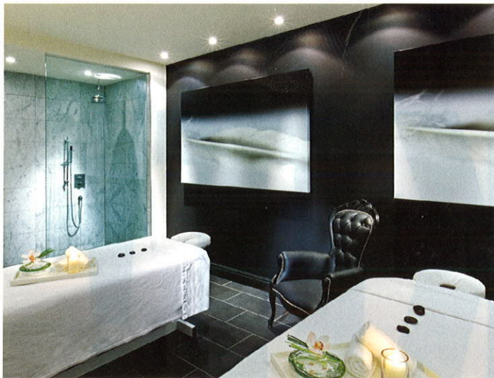
Donato Salon + Spa's couple's spa sanctuary room