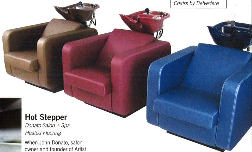
The Plush Backwash Chairs by Belvedere

Doesn't the word “plush” in the name just say it all? The backwash chairs feature a cast iron porcelain enamel pivoting bowl for maximum support and a fully padded upholstered chair with 4-in. wide armrests and optional ottoman for client comfort. Info: belvedere.com